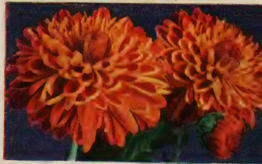
© RED GOLD. 50c each; 3 for $1.25